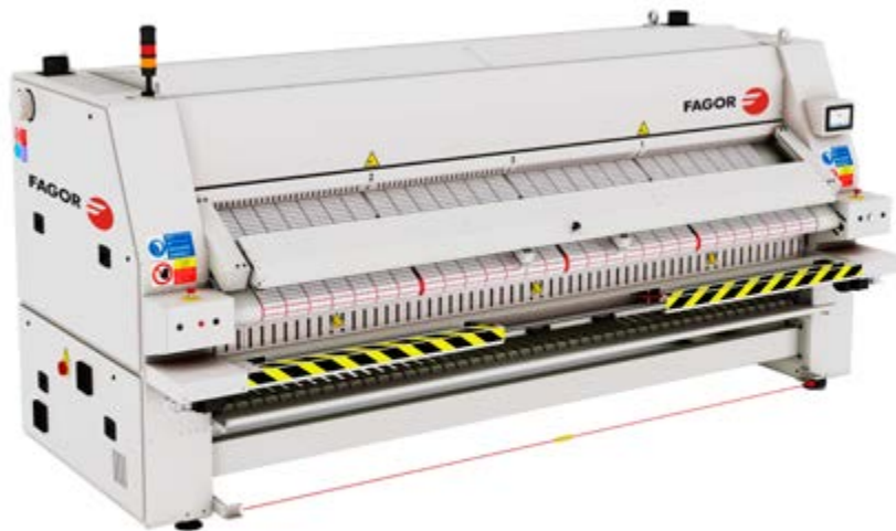
POSEIDON with optional automatic feeder

The POLARIS models on the other hand are dryer-ironers only, with the option of working as pass-through machines, without any type of folding.