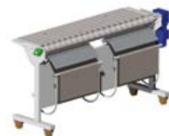
Two-lane serviette collector