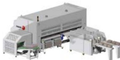
Compact stacker + Two-lane serviette collector + Smarty