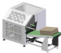
Compact stacker 10/15 tablecloths 10 sheets